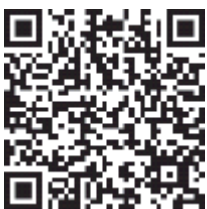
iTunes for iPhone