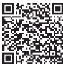
Google Play for Android